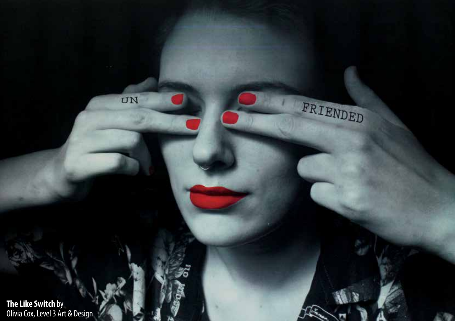
The Like Switch by Olivia Cox, Level 3 Art & Design